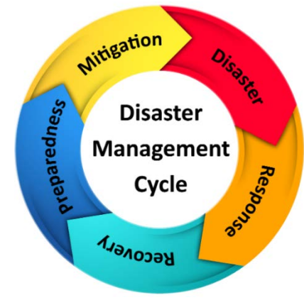
Figure 1. Disaster Management Cycle

Mitigation, preparedness, response, and recovery strategies are largely based on analyses of natural and technological hazards with a history of or potential for impacts in Pennsylvania. The CEOP is designed to address all hazards identified in the Threat and Hazard Identification and Risk Assessment (THIRA)/Stakeholder Preparedness Review (SPR) and the Commonwealth of Pennsylvania Hazard Mitigation Plan (HMP).