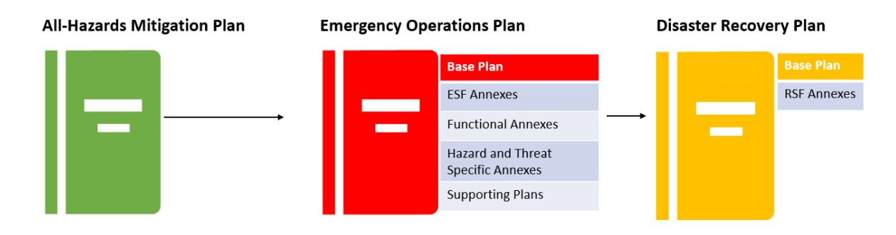
Figure 2. PEMA Plan Hierarchy

The HMP identifies the risks and vulnerabilities common in Pennsylvania, the CEOP describes the Commonwealth's response to those hazards, and the Disaster Recovery Plan guides the Commonwealth's recovery operations following a disaster. The plan hierarchy ensures that emergency management efforts are well-coordinated, scalable, and adaptable to various types and sizes of emergencies. It promotes effective communication, resource management, and collaboration among different levels of government, agencies, organizations, and stakeholders involved in emergency response and recovery.