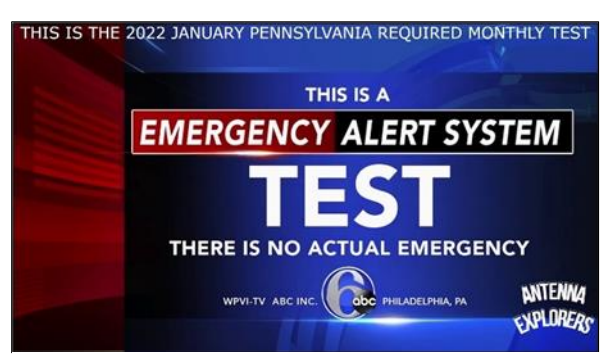
An example of a monthly EAS test message.

To warn residents of potential threats to life or property, PEMA and counties utilize the Emergency Alert System (EAS). Activation of the EAS for any disaster can be accomplished in a matter of minutes anywhere in the Commonwealth. PEMA operates the Commonwealth Watch and Warning Center, which has the capability to generate the EAS signal for delivery statewide or in any area within the