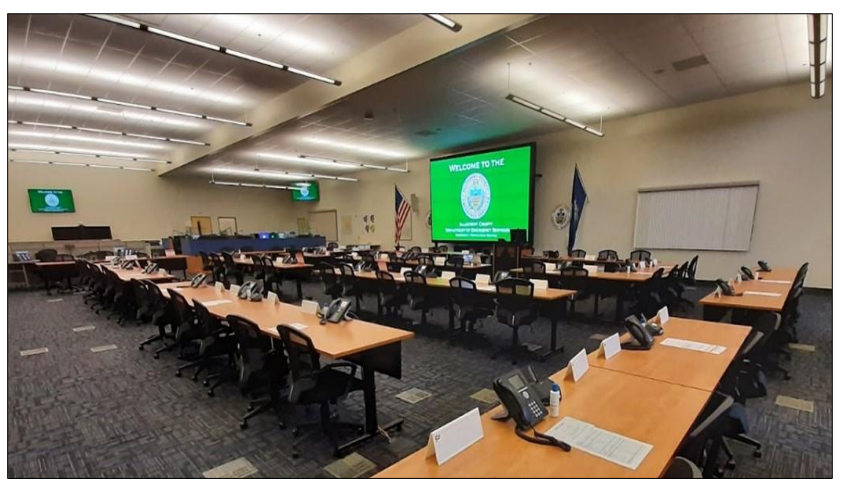
Allegheny County Emergency Operations Center

An important part of the planning process is determining which agencies should have representation in the EOC. Some types of emergencies may not require every staff member or agency to be present. It may become necessary to call in outside experts to assist in the EOC