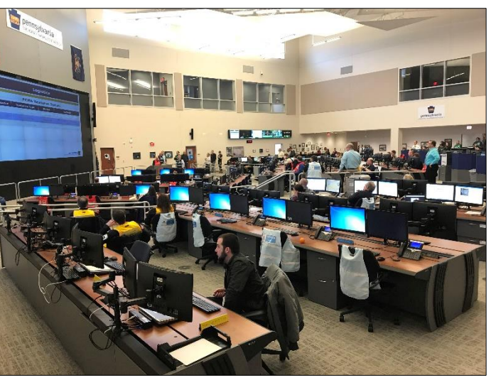
Commonwealth Response Coordination Center located at PEMA Headquarters in Harrisburg, PA

During a disaster, it is important that governments speak with a single, unified voice. This is essential both from the viewpoint of orchestrating an effective response and for the psychological well-being and morale of the population. Effective communication between all entities of local government, as well as government at other levels, will enhance the confidence of the citizens in addition to better protecting lives and property.