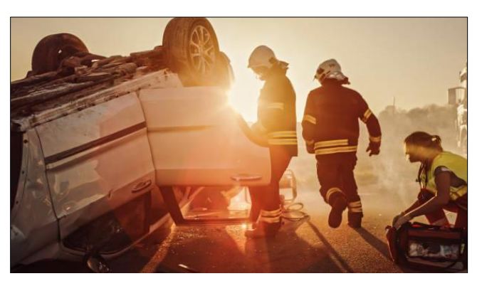
Emergency responders on-scene after an accident.

All disasters start at the local level, and communities have varying local response capabilities to mitigate these officials emergencies. Elected are responsible for everyone in the community whether they are residents or visitors. All responses to disasters and emergencies should be performed at the lowest level capable of handling the emergency using the National Incident Management System (NIMS) (See Chapter 5).