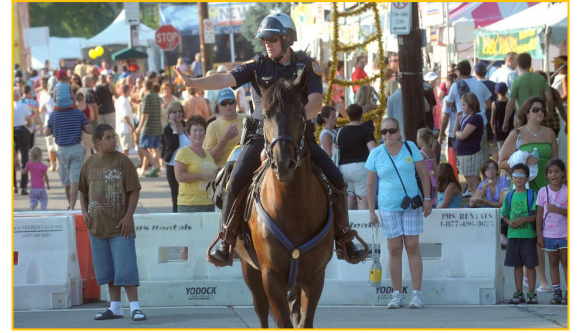
Bethlehem police officer at Musikfest in Bethlehem, PA

Many Task Force resources are used during the annual arts and culture event, including the Joint Hazard Assessment Team. Resources are used to provide medical response, suspicious package investigations, fire suppression, and civil order.