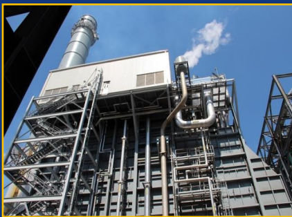
Duke Energy's gas-powered plant, Masontown, Pennsylvania.

The private sector owns and operates an estimated 85% of infrastructure and resources that are critical to our physical and economic security. GOHS has mapped over 30,000 sites in Pennsylvania.