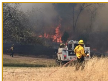
16 Mile Fire: 2nd largest wildfire in the state in more than two