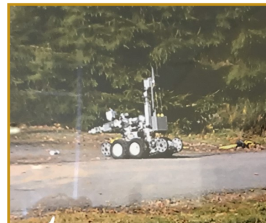
Bomb robot: A critical task force asset