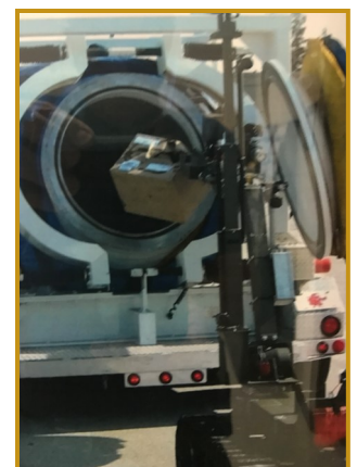
Task Force Asset: Bomb Disposal Equipment

The Northeast Task Force invests HSGP funds wisely by sharing costs for training and equipment among members and ensures consistent training standards.