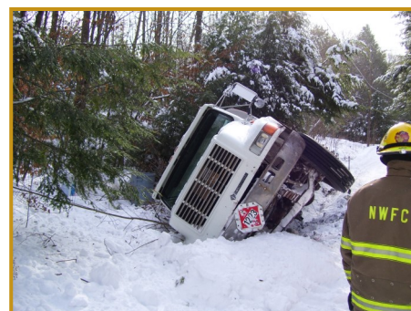
Hazardous materials response