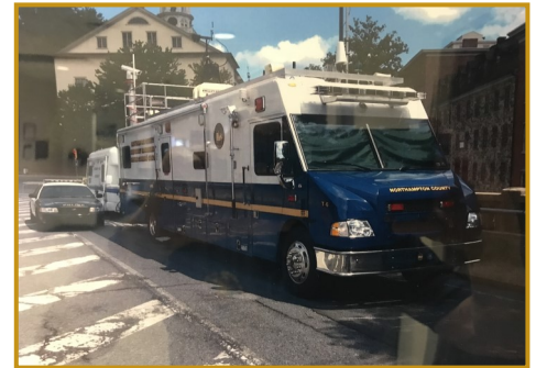
The Mobile Command Post used at the Celtic Festival and at Musikfest is utilized throughout the region.

The Northeast Pennsylvania Regional Counter-Terrorism Task Force provides emergency response training, planning, and equipment to the emergency service providers in the region. The mission of the of the Task Force is to protect human life, work to mitigate emergencies, and respond to human-made and natural disasters throughout the region.