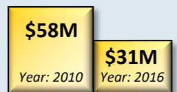
HSGP and UASI funds awarded to Pennsylvania

Homeland Security Grant Program Funding (HSGP) has dropped 48% since 2010. However, demand for services continues to increase. For example, in 2016, PaCIC received 993 reported cyber compromises, an increase of over 400 since 2015.